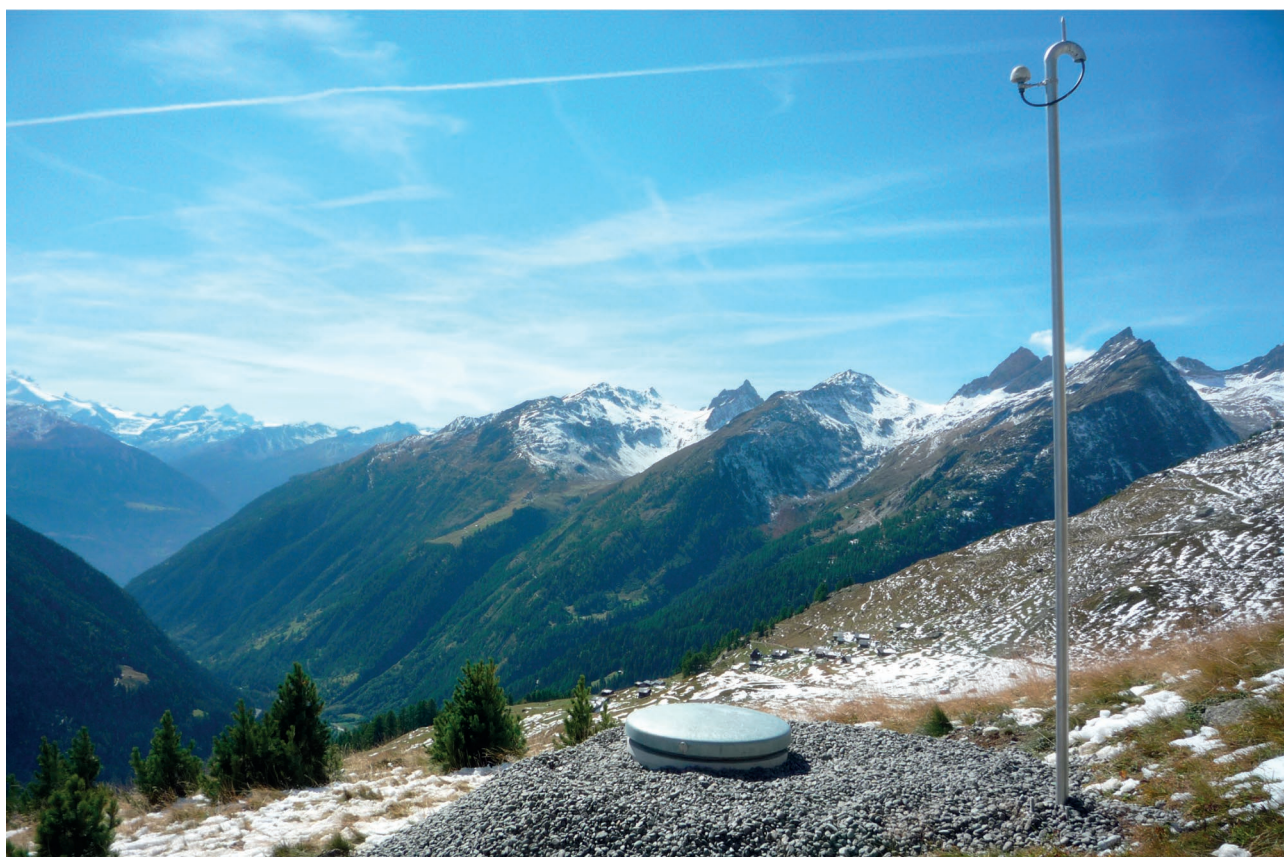
Monitoring station of the Swiss Seismological Service on Lauchernalp in the Lötschental (VS). The data collected by the Swiss and European seismic networks are standardised and made accessible via EPOS-ERIC. EPOS offers many further services and data sets in the field of geosciences. Swiss Seismological Service at ETH Zurich.

For five of the infrastructures that were deemed to be of high relevance in the 2019 Roadmap (ACTRIS, eLTER, ECCSEL, SHARE and ESSurvey), in-depth reviews will need to be carried out prior to Switzerland joining them, in particular due to changes in their ERIC status or the organisational structure of the scientific community concerned.